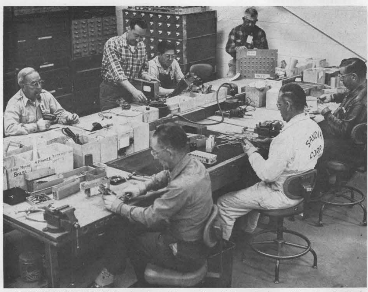
DISMANTLING OPERATION of used equipment to recover usable parts is performed by personnel of Processing Section 4621-2. In the background is a